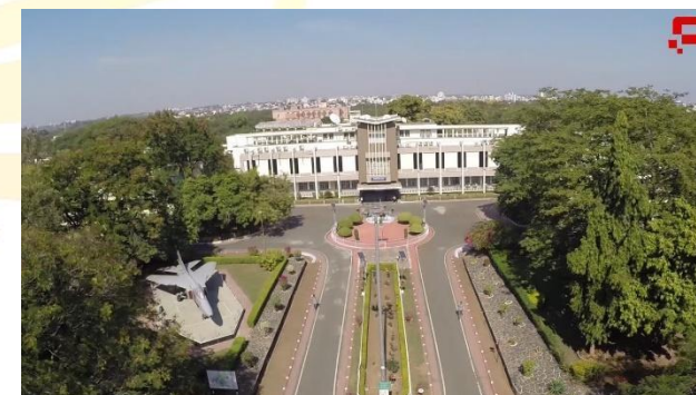
Birds Eye View of the Academic Building, VNIT, Nagpur